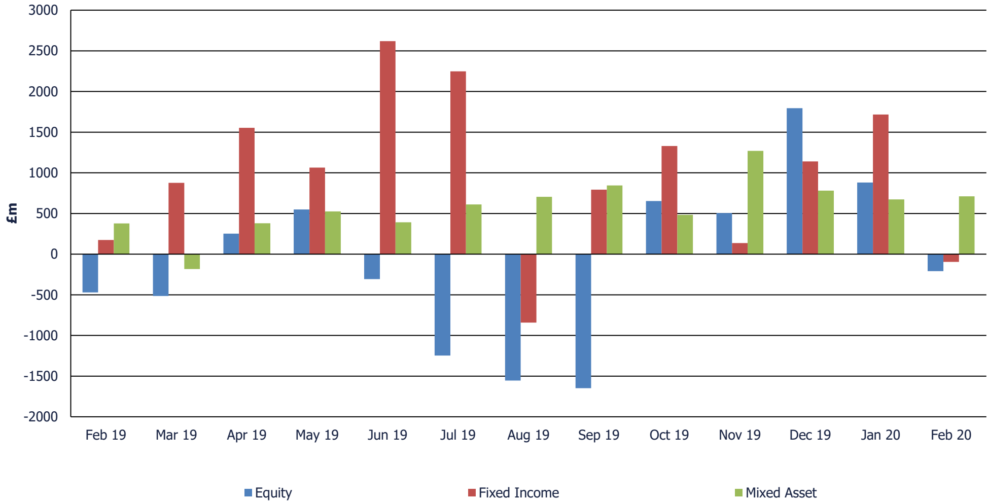
CHART B: NET RETAIL SALES BY ASSET CLASSES (UK DOMICILED FUNDS)