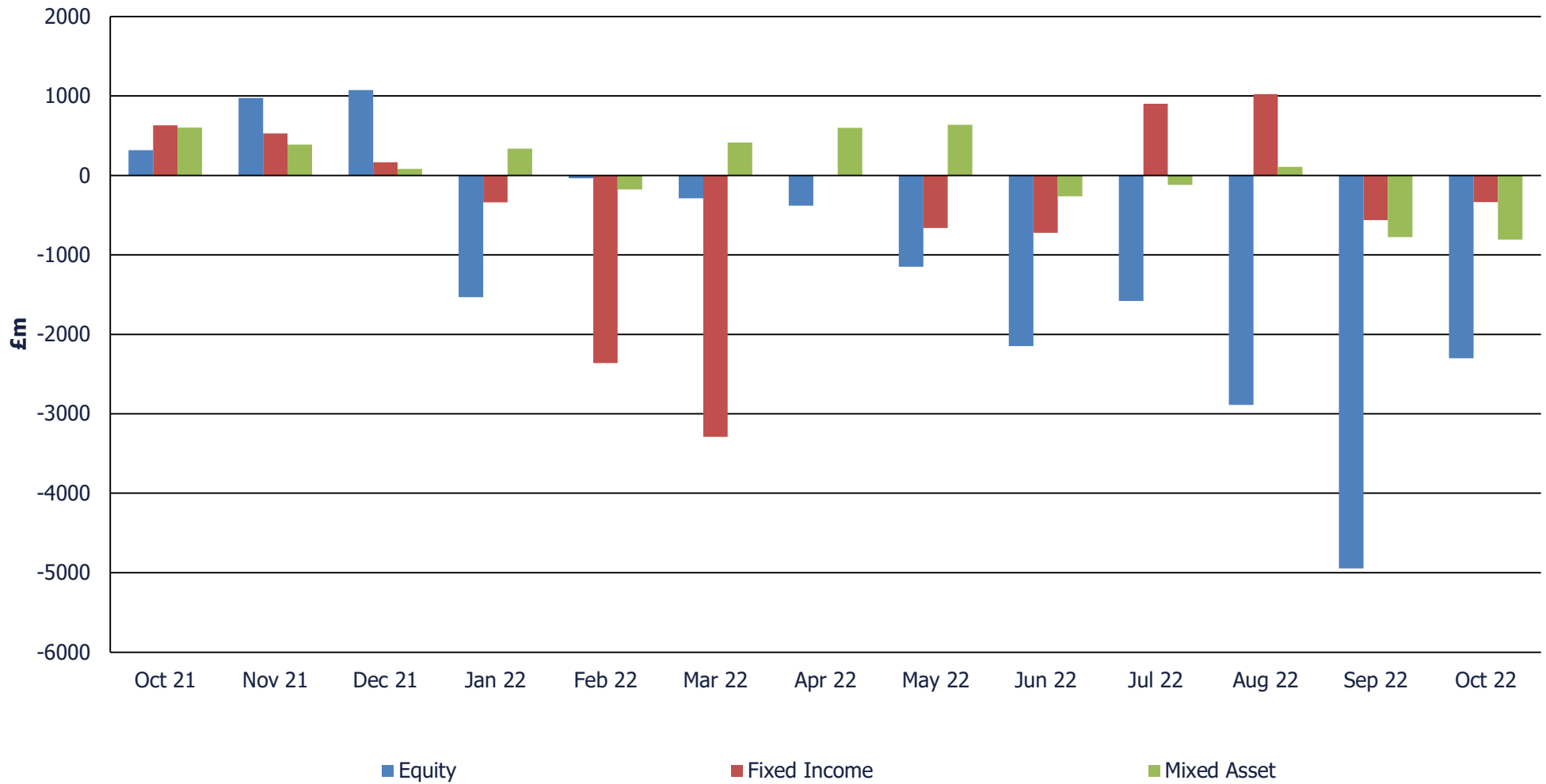
CHART B: NET RETAIL SALES BY ASSET CLASSES (UK DOMICILED FUNDS)