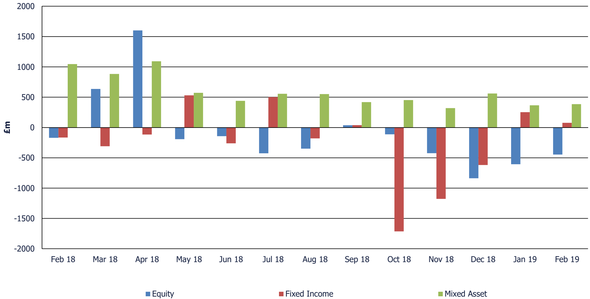
CHART B: NET RETAIL SALES BY ASSET CLASSES (UK DOMICILED FUNDS)