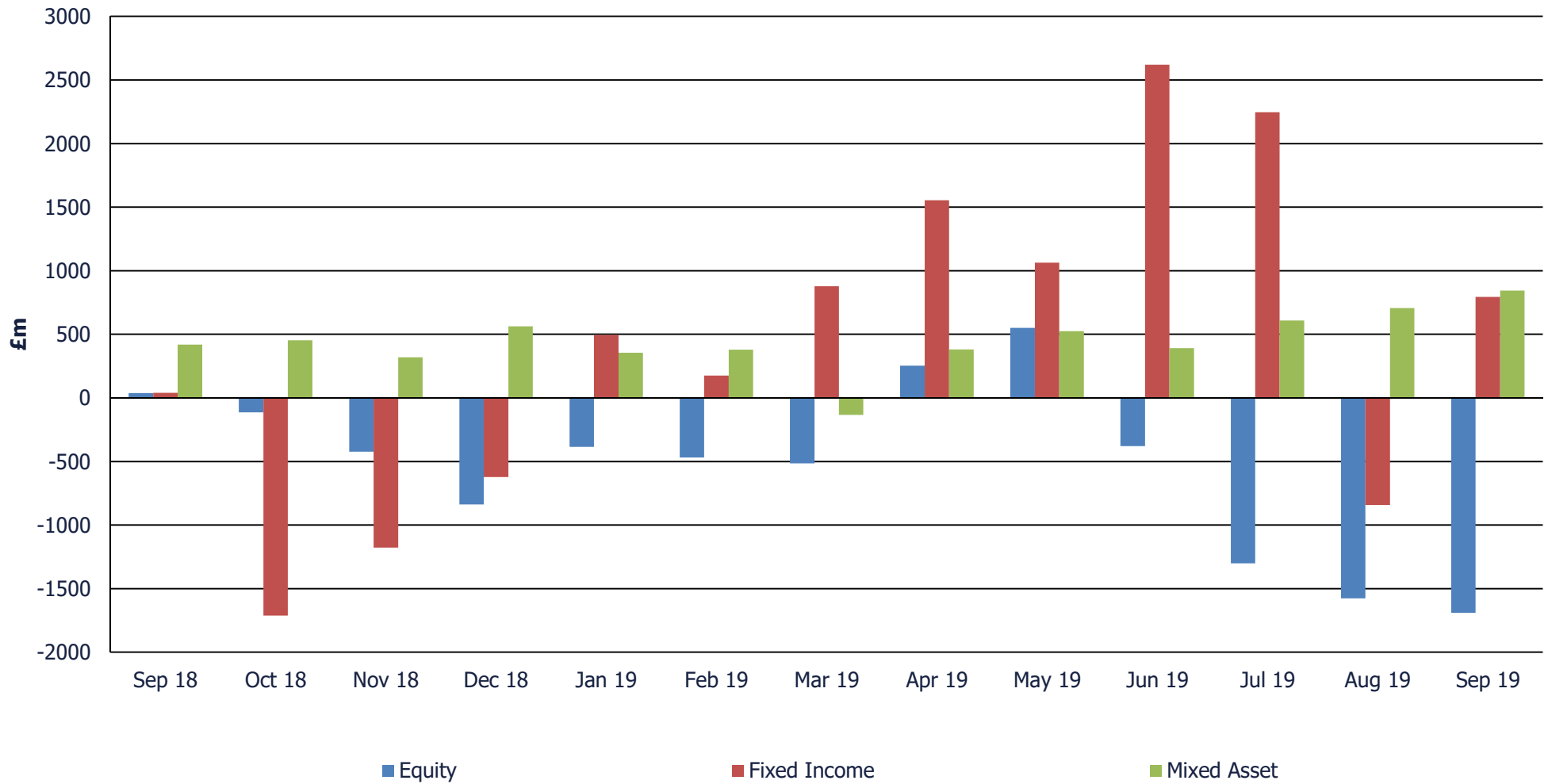
CHART B: NET RETAIL SALES BY ASSET CLASSES (UK DOMICILED FUNDS)